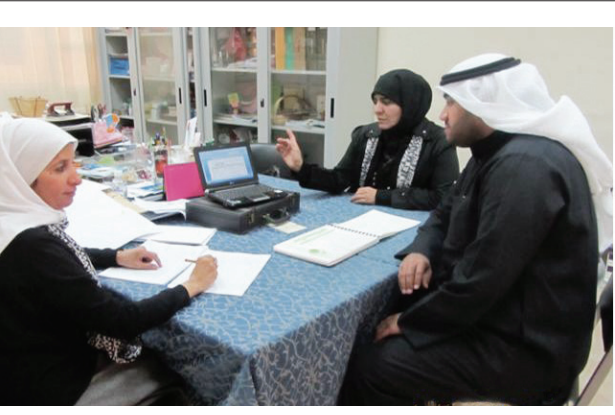
The Award area attracts visitors of Dubai Heritage Village

Bahrain participates with 14 applications